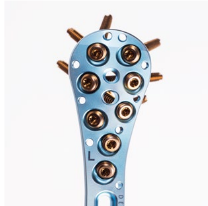
Exact anatomical fit with mandatory definition of the side