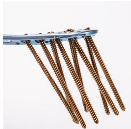
Innovative screw placement for safe support of the joint