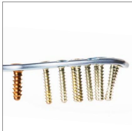
Innovative pre-bending technology of the plate in order to achieve best possible plate - bone alignment