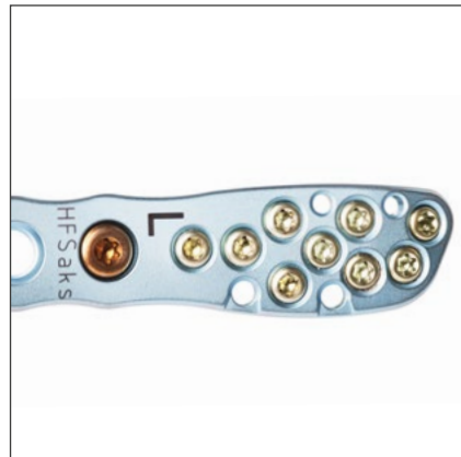
Accurate contour shape of the plate, based on over 100 measured fibulae