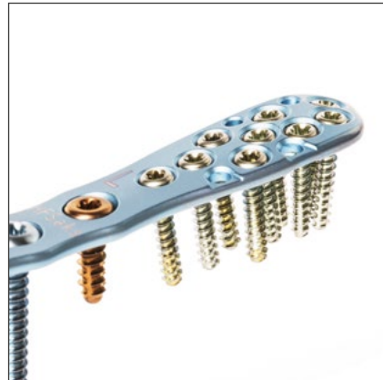
Stable anatomic design for safe preservation of repositioning