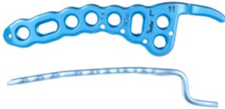
Plate thickness 3.0 mm Compatible to: Shaft area: INTEOS® 3.5 screws / ForceDRIVE 10