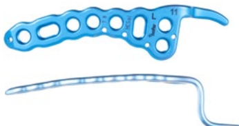
Plate thickness 3.0 mm Compatible to: Shaft area: INTEOS® 3.5 screws / ForceDRIVE 10