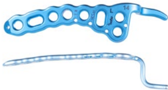
Plate thickness 3.0 mm Compatible to: Shaft area: INTEOS® 3.5 screws / ForceDRIVE 10